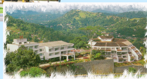
Institute of Fundamental Studies