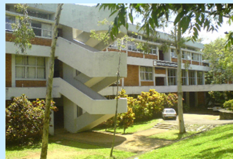
University of Moratuwa