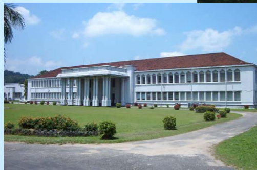
University of Peradeniya