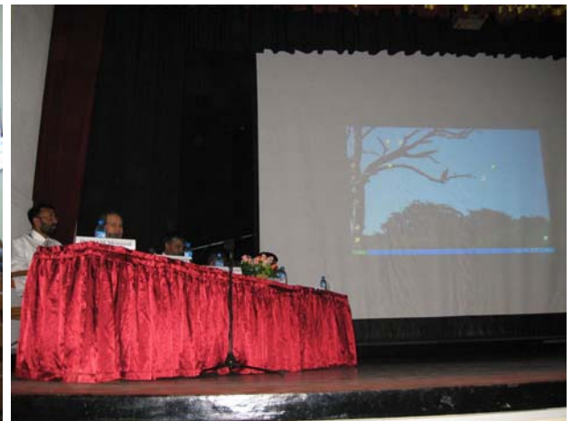
各大学の Keynote Speakers