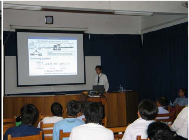
浅本助教による Keynote Speech