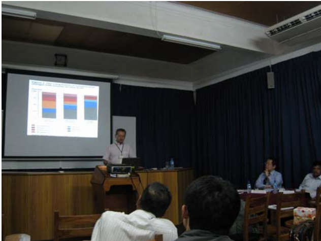
角川教授による Keynote Speech